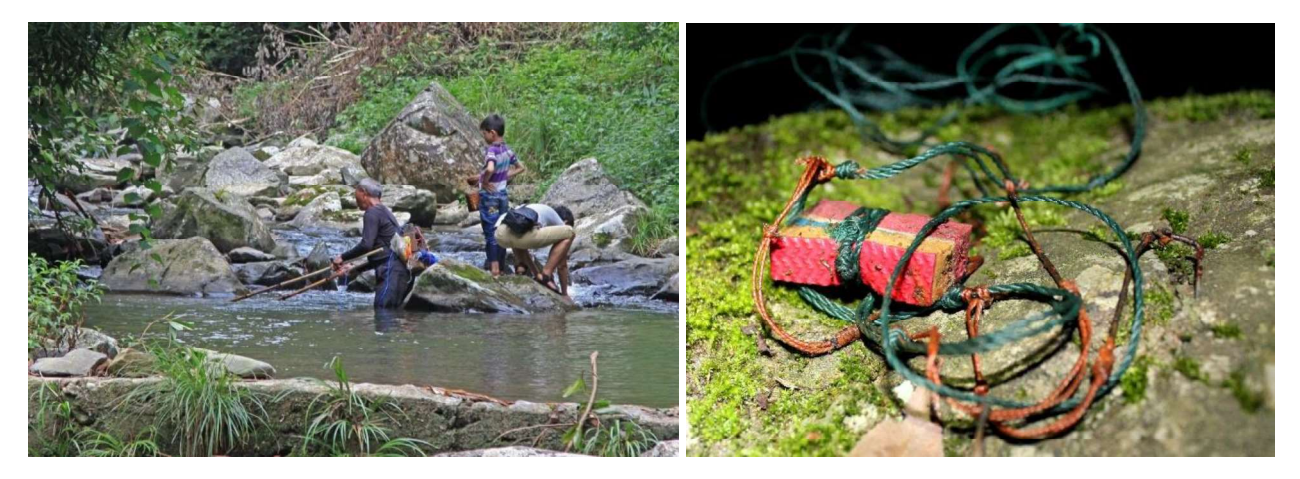
Figure 9. Electrofishing in Chinese giant salamander habitat (left). Figure 10. A bow hook targeting Chinese giant salamanders in a protected area in Guizhou Province (right)