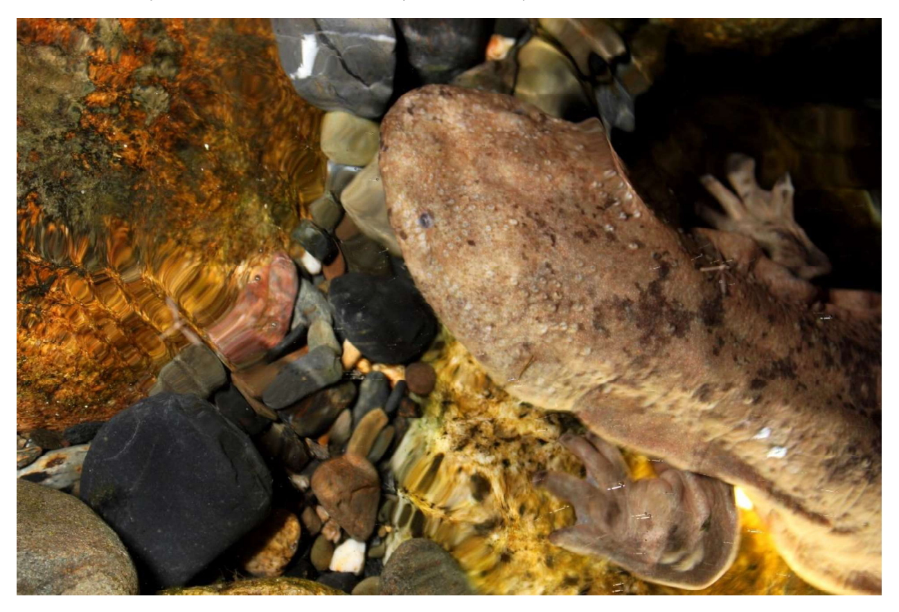
Figure 3. A Chinese giant salamander encountered during ecological surveys in Shaanxi Province © Benjamin Tapley / ZSL.

Chinese giant salamanders are the largest extant amphibians, growing to almost 2 m in total length, and can weigh more than 50 kg (Wang et al., 2004). All Andrias species have large, broad flattened heads and small lidless eyes, flattened bodies with obvious longitudinal folds, sturdy limbs, and a large compressed tail. They are extremely variable in colouration from black to dark red to numerous shades of brown, often with blotches (Sparreboom, 2004). Colour morphs are also reported from farms.