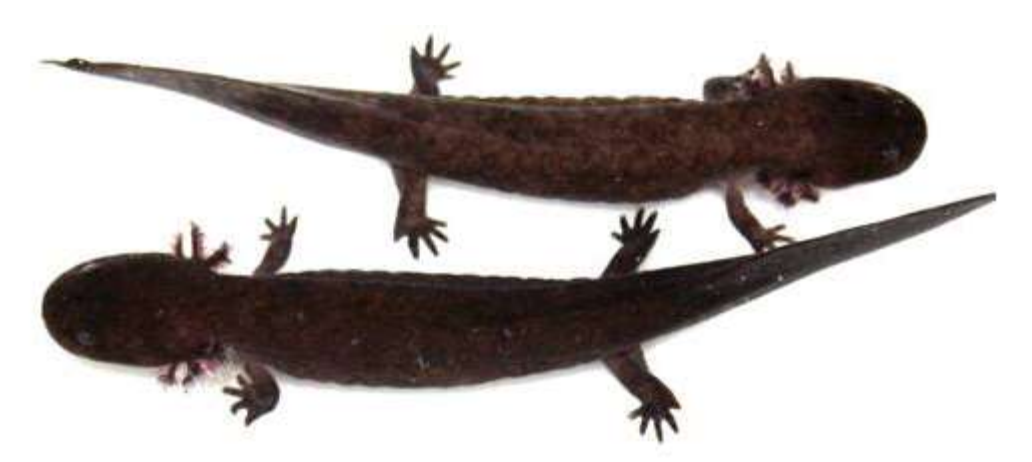
Figure 4. Chinese giant salamander larvae from a farm in Guizhou Province

Note that the following information is not attributable to a specific Chinese Andrias species.