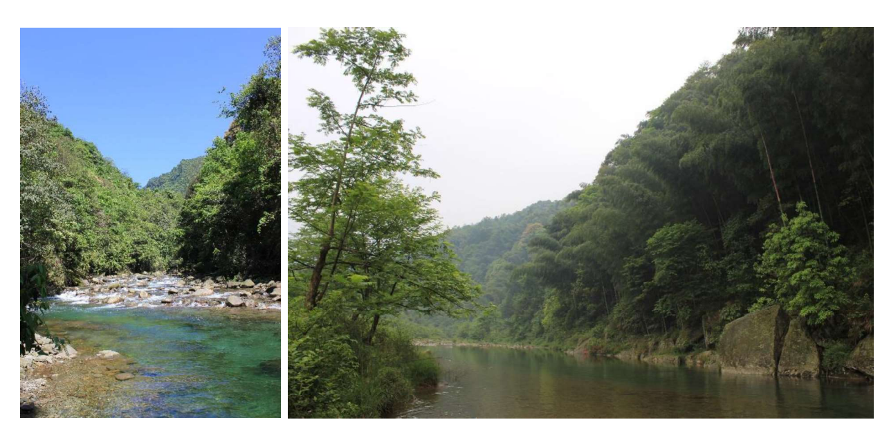
Figures 5 & 6. Chinese giant salamander habitat, Fanjingshan, Guizhou Province © Benjamin Tapley / ZSL.