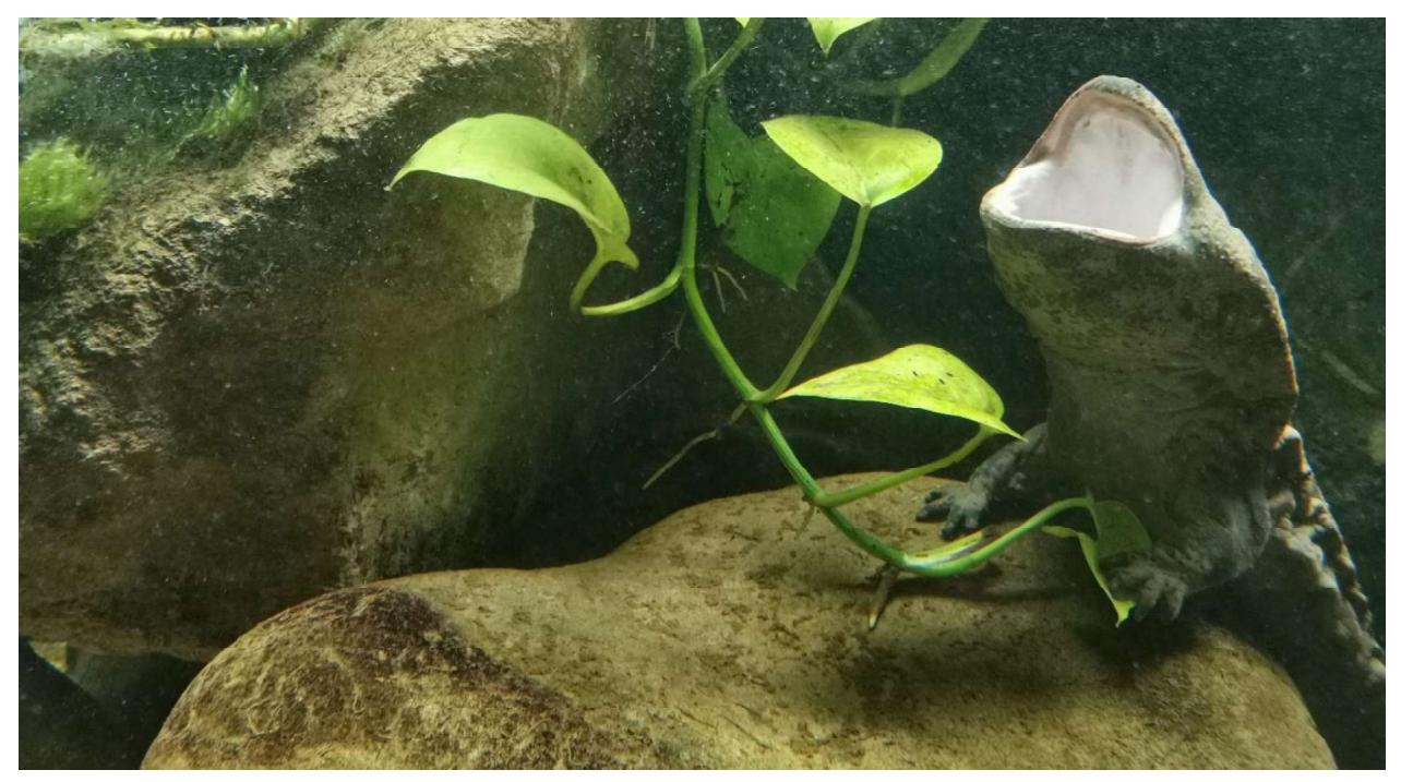
Figure 1. A Chinese giant salamander in captivity in Europe, rescued from the illegal wildlife trade

Chinese giant salamanders ( Andrias spp.) are the world's largest amphibians. These salamanders are economically important and are extensively farmed in China for their meat. Whilst Chinese giant salamanders were consumed historically across China, a large-scale farming industry was established in the early 2000s and giant salamanders were collected from the wild to stock these farms. Populations of Chinese giant salamanders have declined across China, and these declines have primarily been driven by overexploitation as well as habitat loss and degradation. Giant salamanders in China were once considered to be a single widespread species ( Andrias davidianus ) but genetic analyses have revealed that there are multiple species (likely at least seven) and that populations across central, eastern and southern China represent genetically distinct, local populations. Currently four species are formally named and recognised by the scientific community, and it is likely more will be described in future. China's government has supported releases of farmed giant salamander as a conservation measure, but this has resulted in the release of non-native giant salamanders across China and there is a risk that wild populations could hybridise with released non-native species. An urgent, large scale conservation response is required if Chinese giant salamanders are to persist in the wild, and this will require a collaborative and coordinated strategy with all stakeholders.