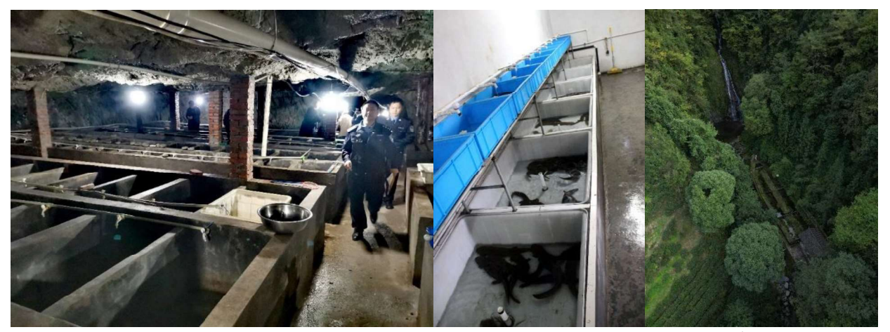
Figure 11. Industrial-style Chinese giant salamander farm in Gansu Province © Benjamin Tapley / ZSL (left) Figure 12. Industrial-style Chinese giant salamander farm in Shaanxi Province © Benjamin Tapley / ZSL (middle) Figure 13. A farm using "wild type" farming methods in Gansu Province © Chenhaojia Liu (right)

In recent years there have been several reported cases of illegal international trade in Chinese giant salamanders, and animals have been seized from the illegal wildlife trade in the United States of America, United Kingdom, Philippines, South Korea, Vietnam and Singapore.