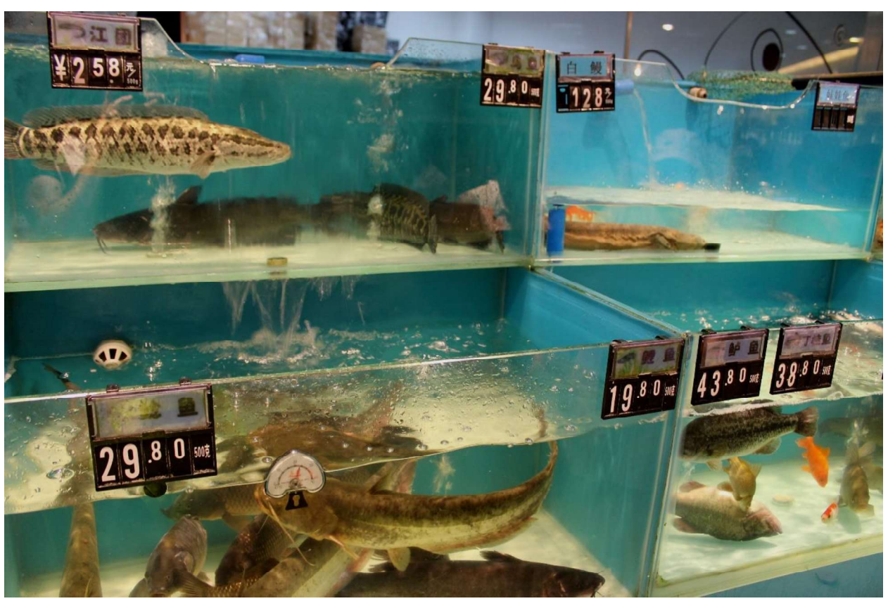
Figure 8. A Chinese giant salamander (likely farm bred) being sold in a supermarket in Guiyang

The range-wide decline of giant salamanders across China has been attributed to overexploitation for various food markets (Wang et al., 2004; Feng et al., 2007; Dai et al., 2009; Cunningham et al., 2016; Turvey et al., 2018, 2021; IUCN SSC, 2023a,b), and to habitat loss and degradation resulting from anthropogenic modification of freshwater habitats, including pollutant emissions and alteration of flow regimes and water turbidity from damming (Wang et al., 2004; Dai et al., 2009).