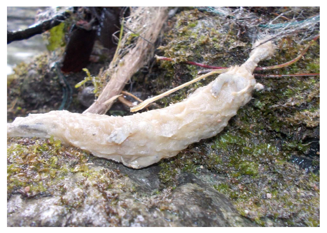
Figure 7. The corpse of a Chinese giant salamander found at a site where farmed animals had been recently released

native Chinese Andrias range (Shu et al., 2021). Hybrids between Chinese and Japanese giant salamanders are now invasive in parts of Japan (Fukumoto et al., 2015; Nishikawa et al., 2024). Given that Andrias spp. from China are more closely related to each other than A. japonicus, it is likely that different species of giant salamanders in China are able to hybridise. It is therefore likely that hybridisation with both described and undescribed congeners is a threat to this species. China's Aquatic Wildlife Conservation Association (CAWCA) has acknowledged that there are at least five species of giant salamanders in China and recommend that releases of giant salamanders from farms should be prohibited unless animals are genetically screened to confirm species identity. Unfortunately, there is no centralised mechanism in place to ensure that genetic screening is undertaken, that results are correctly interpreted, and appropriate release sites for each species are identified.