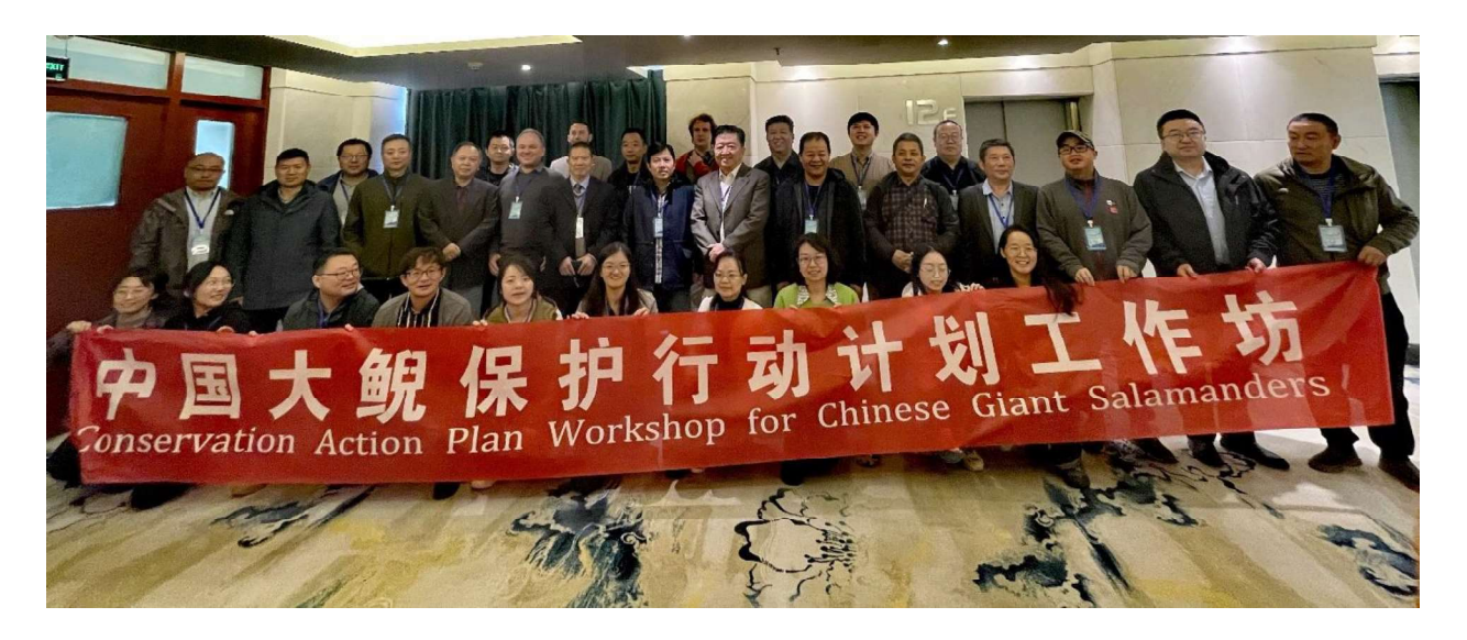
Figure 15. Participants at the Conservation Action Plan Workshop for Chinese giant salamanders held in October 2023, Lanzhou.

Chinese giant salamanders occur over a large geographical area and the threats posed to them are diverse, and addressing these will require the active participation of many different stakeholders. There is now a sufficient evidence-base on which to act to prevent the imminent extinction of the named and unnamed giant salamanders. To this end two NGOs, Green Camel Bell and the Zoological Society of London, worked with the Chinese Academy of Science to organise a workshop on the conservation of Chinese giant salamanders (Mao et al., 2024), which was held in Lanzhou in October 2023. This multi-stakeholder workshop brought together 32 stakeholders with expertise in giant salamanders from across China, including from regional and national governments, business, NGOs and academia (including genetic, ecological and conservation research), together the IUCN SSC Amphibian Specialist Group. Of these 32 participants, 29 were Chinese nationals, thus ensuring that the action plan is locally led.