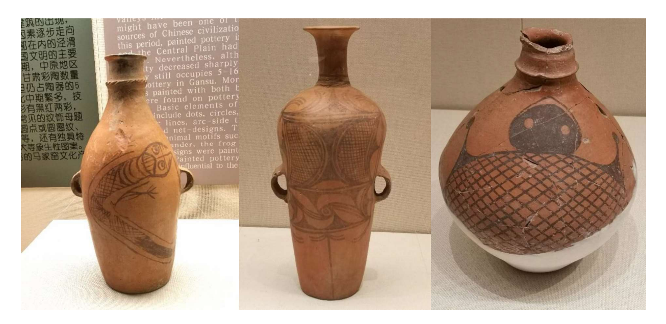
Figure 14. Pottery vases dated from 5,000-6,000 years B.P. depicting Chinese giant salamander designs, unearthed in Gansu Province

Chinese giant salamanders have been depicted and used in China for more than 5,000 years, with some of the earliest images of these animals associated with pottery from the Yangshao culture of the Yellow River region. Chinese giant salamanders are perceived to have a wide range of benefits in traditional medicine (He et al., 2018) and have been used for this purpose for at least 2,000 years (Strassberg, 2002). However, a recent study of local communities living alongside Chinese giant salamanders found that whist Chinese giant salamanders were used in traditional medicine (specifically for skin ailments), no one reported using salamanders for this purpose this century. They have also a long history of being exploited for meat, with the first record of human consumption dating back more than 3,500 years ago (Ebrey, 1996;