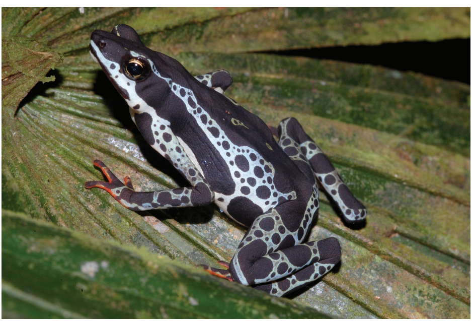
Vulnerable Pebas Stubfoot Toad, Atelopus cf spumarius