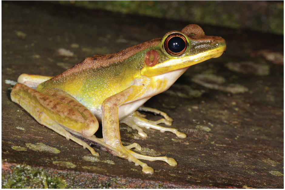
Least Concern Chalcorana raniceps

i. Out of the 8,000+ described amphibian species, 3,674 amphibian species have assessments dated 2009–2019. Results include assessment dates in 2019 as the GAA2 is now planned for completion in 2020; numbers are taken from Red List version 2019-3. (KSR #1)