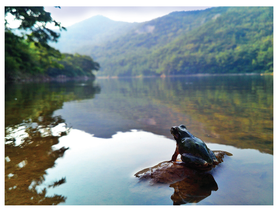
Least Concern Japanese Treefrog, Dryophytes japonicus