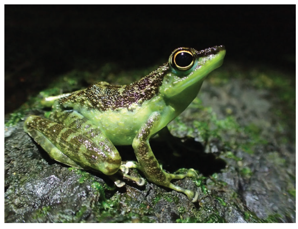
Black-spotted Rock Frog ( Staurois\ guttatus ), Least Concern