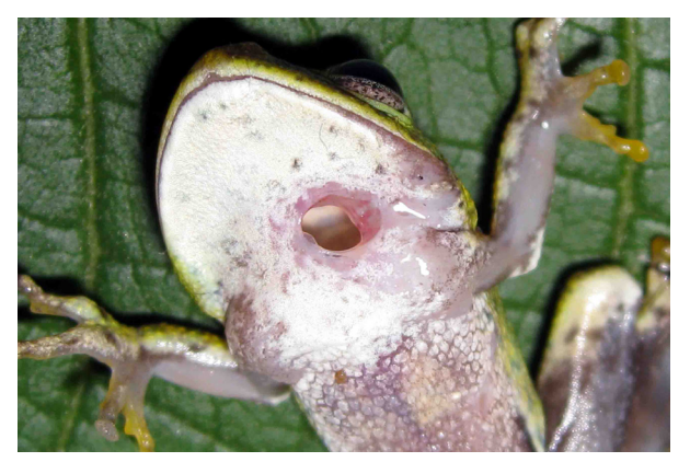
Figure 3. Fatal attack on the chin of Philautus viridis

The above two cases suggests not only of an unusual