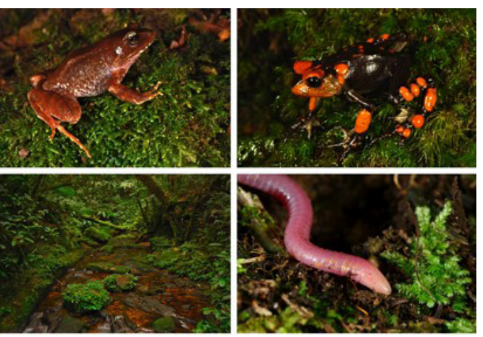
Diversity of the Nguru Mountains

main blocks. Several localities were surveyed for the first time during this work. The surveys were conducted collaboratively by a group of herpetologists working in the region. A recent survey of the Nguru Mountains