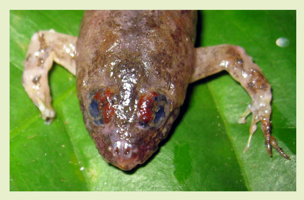
Figure 2. Conspicuous 'red patch' in a dead specimen

survey, we observed a conspicuous 'red patch' externally above the prominent eye balls of Eu phlyctis cyanophlyctis (Schneider, 1799) (Skipper frog = English; Utpatana mädiya = Sinhala). It was present in both sexes (Figure 1). Two frogs that had this condition died, however, the 'red patch' infection was highly visible even in the dead specimens (Figure 2).