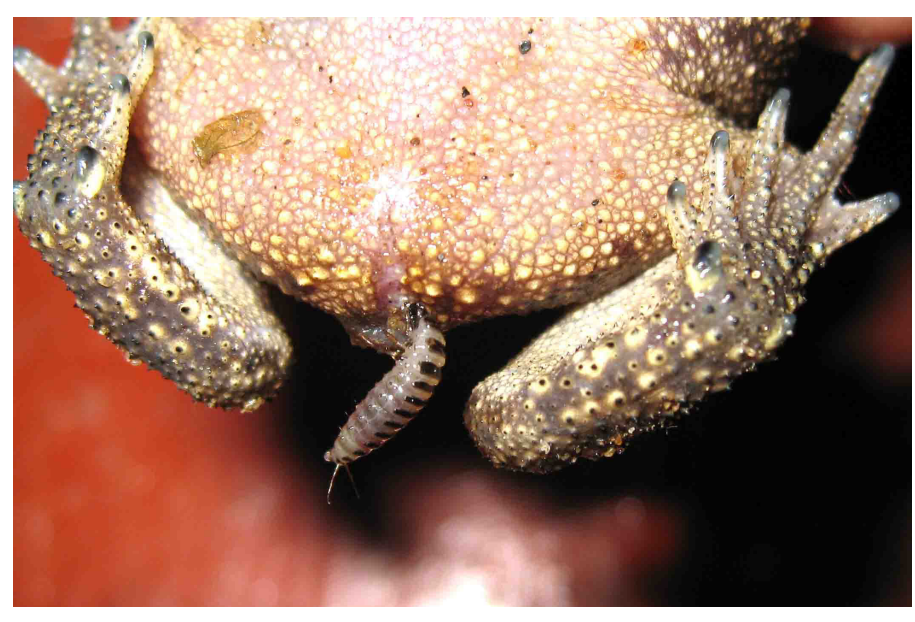
Figure 1. Beetle larvae clinging on to Duttaphrynus melanostictus