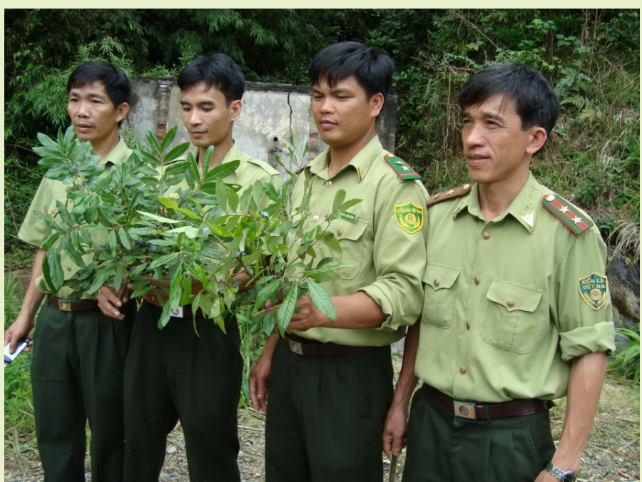
Fig 3. Release of froglets (Rhacophorus dennysi) within Tam Dao National Park, Vinh Phuc Province, Vietnam

Ghate, H. V., and Kent, Y. (2006b). New species of Theloderma from Kon Tum Province (Vietnam) and Nagaland State (India) [Anura: Rhacophoridae]. Russ. Jour. Herpetol., 13(2): 135-154.