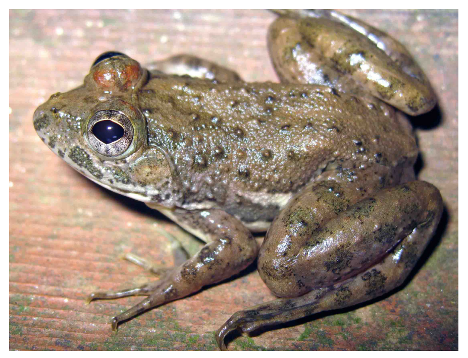
Figure 1. Skipper frog (Euphlytics cyanophlyctis) showing 'red patch'

Of several species of sympatric aquatic anurans that were investigated during the ongoing