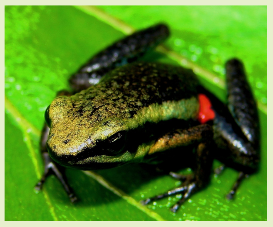
Oxapampa poison frog, Meerega planipaleae.

The Oxapampa poison frog Ameerega planipaleae (Anura: Dendrobatidae) was discovered in 1996 and described in 1998 under the name Epipedobates planipaleae (Morales & Velazco, 1998) from only four specimens (one female and