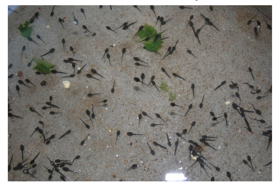
Fig 2. Tadpoles of Rhacophorus feae