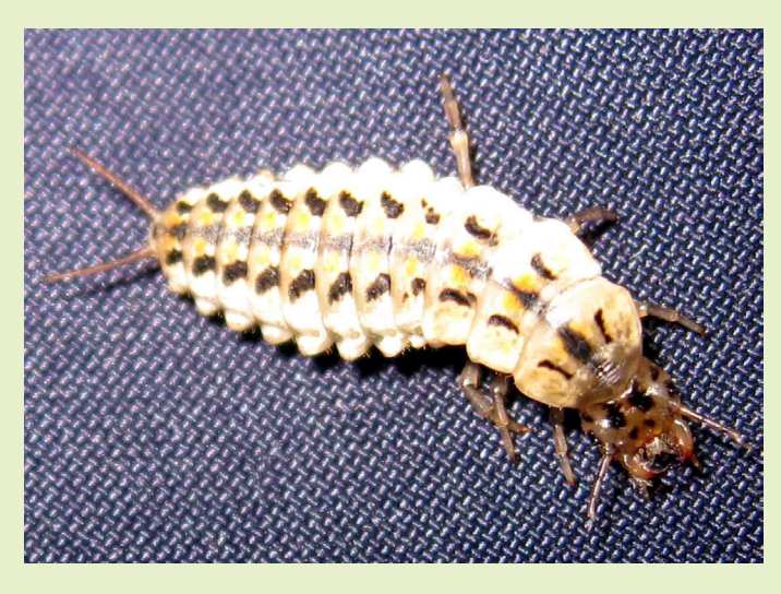
Figure 4. Unidentified beetle larvae

predator of amphibians, but also that it could be fatal for amphibians.