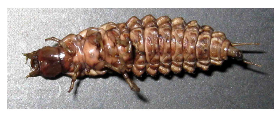
Figure 2. Unidentified beetle larvae

On December 9th, 2008 we observed around 10 am a beetle larvae clinging on to a toad: Duttaphrynus melanostic tus Schneider, 1799 (common house toad) in an anthropogenic habitat at Puttalam (N 08° 00' 59.7" and E 7.9 50' 17.7", 28 m asl). The insect was clinging on to the toad by its claw-like appendage about one millimeter above the cloa-