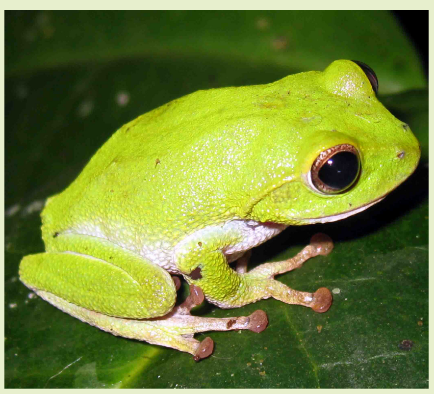
Figure 5. Philautus viridis green color phase