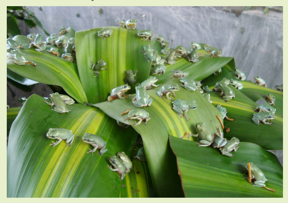
Fig 1. Rhacophorus maximus at the Amphibian Station in Hanoi