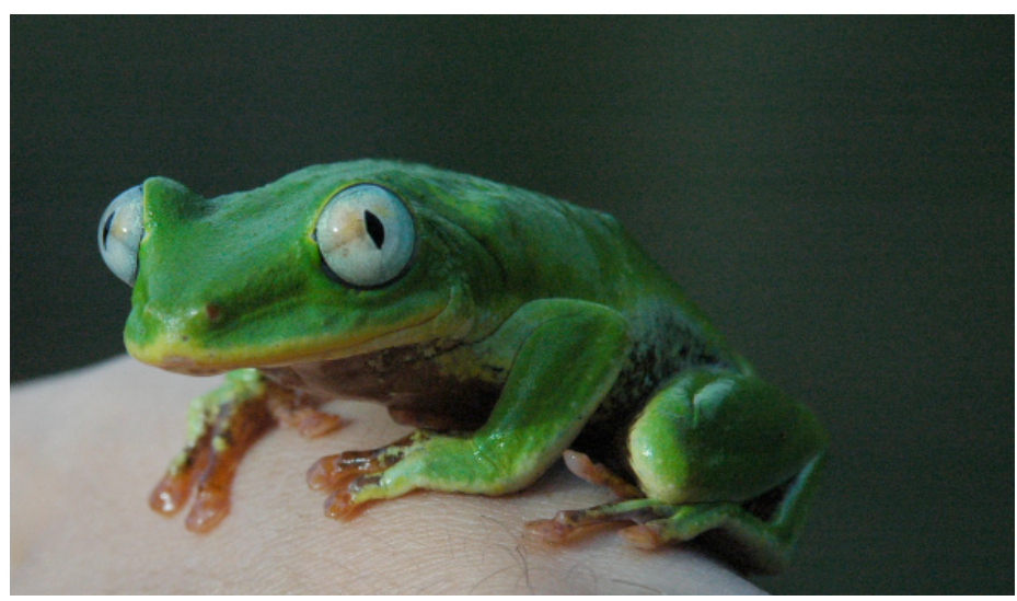
Tree frog Tachycnemis seychellensis

Although the tree frog is frequently heard along mountain streams on Mahé, Praslin and La Digue and in lowland marshes on the latter two islands, it is very rarely encountered on Silhouette island. Over the past 10 years there have been only four sightings of the species on Silhouette, three from within the main settlement on the island. These have all been single adult females and no calling males have been located. In July 2008 a female was found near a stream in the settlement. Closer examination revealed the presence