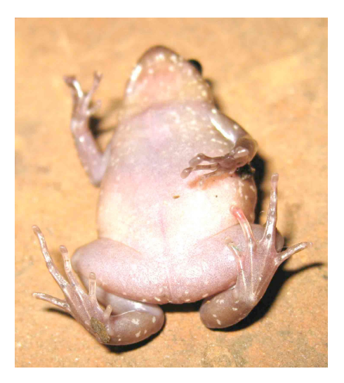
Figure 3. Ectrodactly in Ramanella variegata

Microhyla rubra (Red narrow mouth frog) checked 9 specimens and malformations observed in 1 (11 %)