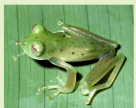
Nymphargus cochranae

Glassfrogs (family Centrolenidae) are endemic to tropi-