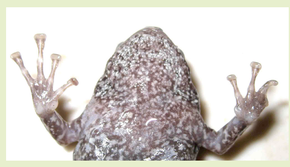
Figure 4. Missing finger in Kaloula taprobanica

frog) checked 8 specimens and malformations observed in 1 (13%)