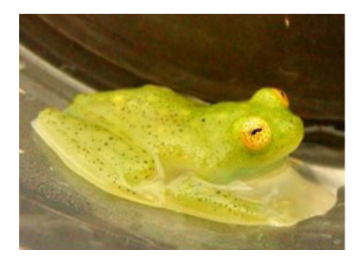
Hyalinobatrachium ruedai