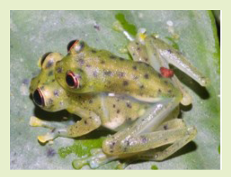
Centrolene Mariaelenae