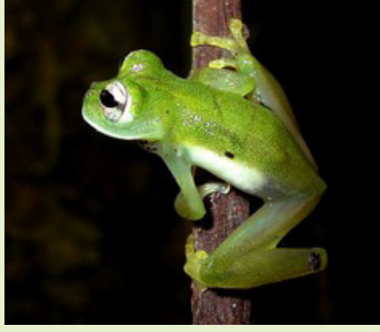
Centrolene durrellorum