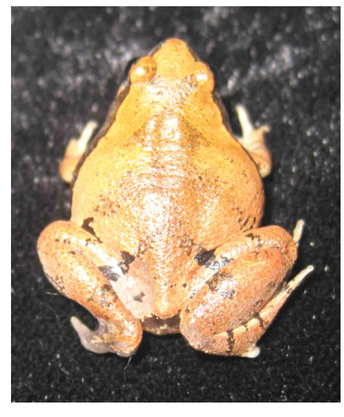
Figure 2. Ecotmelia in hind limb

D reliminary studies on malformations, abnormalities, injuries and parasitic infections in amphibians in the country by one of the authors (Anslem de Silva) have observed malformed and parasitic infected amphibians in several locations of the country. This communication is on the investigations conducted from May to August 2008 on congenital malformations in Microhylids inhabiting the campus park of the Rajarata University and within a one kilometre radius from the campus, located in Mihintale (80021' 11.7"N and 080 30' 09.6" E) in the dry zone lowlands (150-170 m above sea level), in Sri Lanka. The following malformations