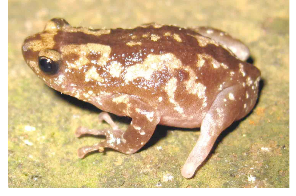
Figure 1. Ectomelia in hind limb