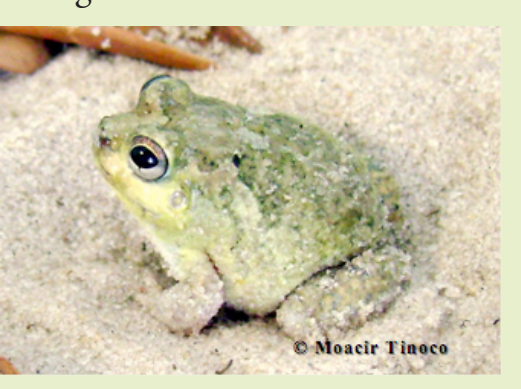
Four eyed frog, Pleurodema diplolistris

of all Restinga in Brazil (SCHINEIDER and TEIXEIRA. 2001). including a portion of this habitat in the Atlantic Forest, classified as a high biological importance area (SOS, 2008).